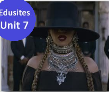
Formation , Beyonce 2016

How to use: Use this Knowledge Organiser to identify the similarities and differences between the two videos.